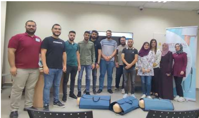
13th, Oct 2021- An-Najah Training Centre

These workshops are designed for governmental and private hospitals to increase the efficiency of the healthcare system at West Bank especially during this hard time and they were attended by 20 doctors and nurses from emergency and intensive care units. The Workshops held at An- Najah life support training centre in An-Najah National University and IMET training centre. the aim of these workshops is to learn about Cardiopulmonary resuscitation (CPR) for healthcare professionals, Automated External Defibrillation (AED) and First Aid. The workshops were led by (American Heart Association “AHA”) Instructors.