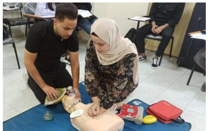
19th, Oct 2021- IMET Training Centre