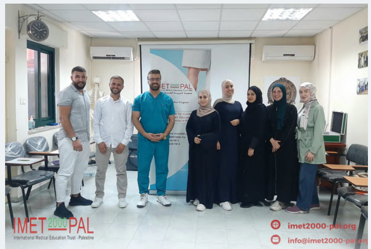
BLS 21st, August, 2023 in coopriation with MUC Training Centre