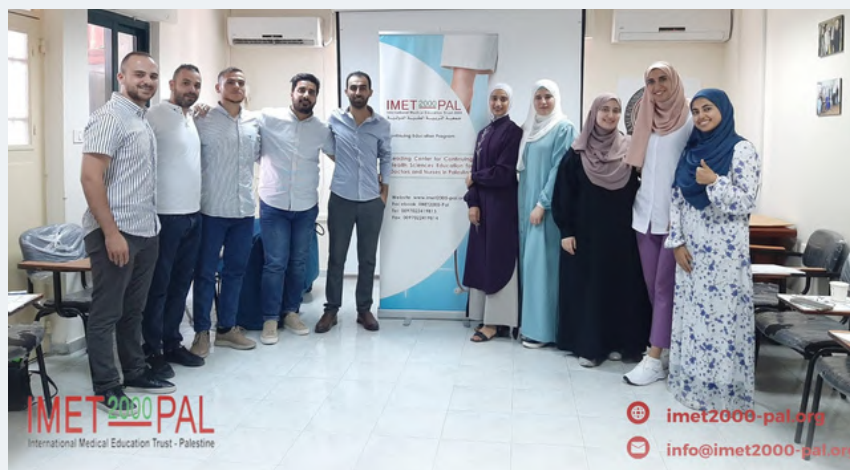
BLS 28th, August, 2023 in coopriation with AAUP Training Centre