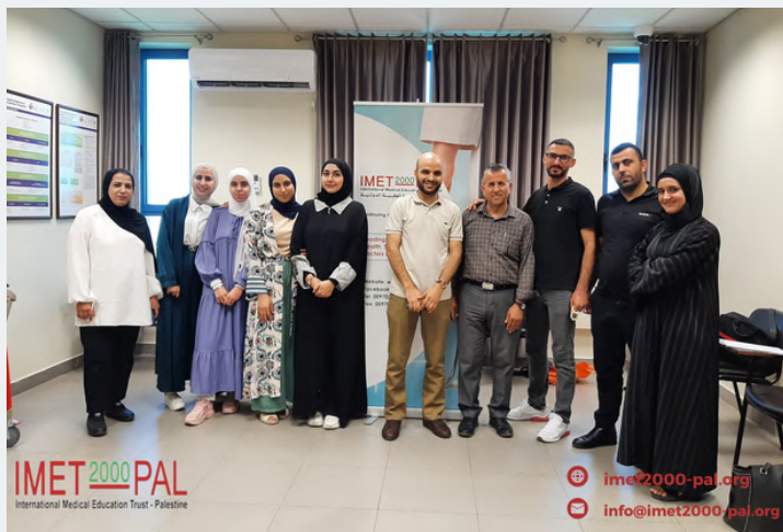
BLS 7th, August, 2023 in coopriation with NNU Training Centre

The workshops aimed to provide instructions and practical sessions about Cardiopulmonary Resuscitation (CPR) for healthcare professionals, Automated External Defibrillation (AED) and First Aid. They were led by certified instructors from American Heart Association(AHA).