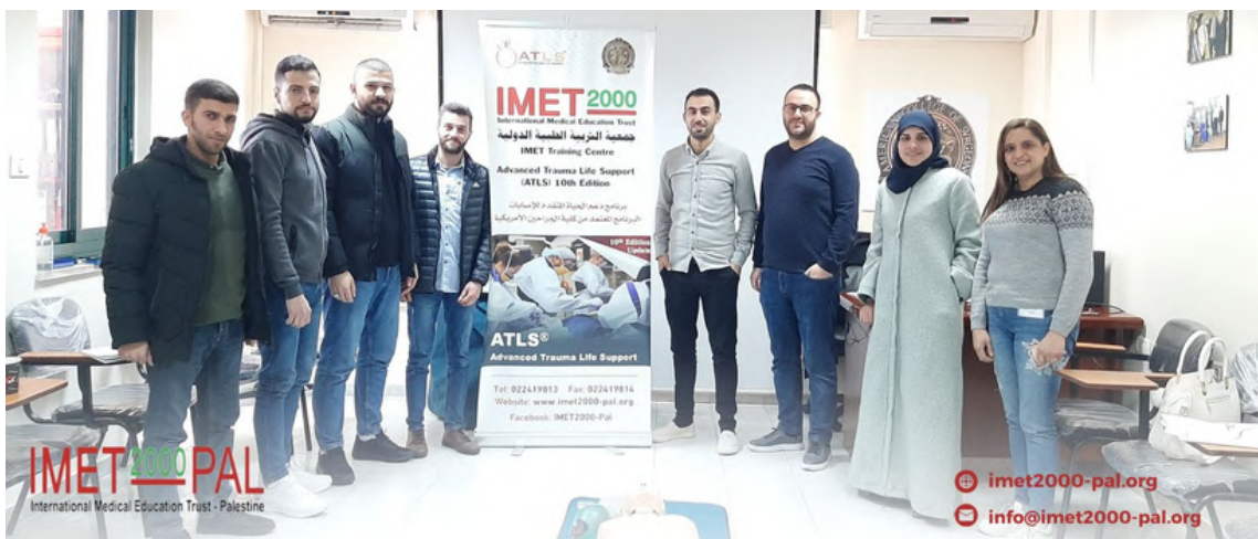
BLS 25th, February, 2023