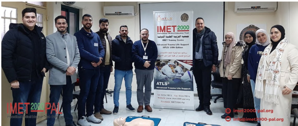
BLS 8th, February, 2023

The workshops took place at IMET2000-Pal Training Centre at Ramallah. These trainings aimed to provide instructions and practical sessions about Cardiopulmonary Resuscitation (CPR) for healthcare professionals, Automated External Defibrillation (AED) and First Aid. They were led by certified instructors from American Heart Association(AHA).