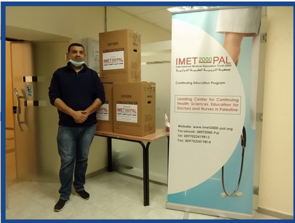
Deir Sharaf Village