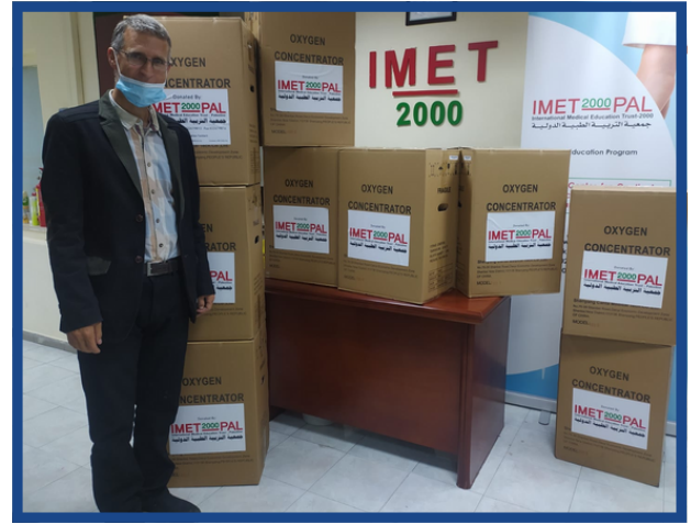
Al Kafreyat Municipality & Al Azb Al Gharby village