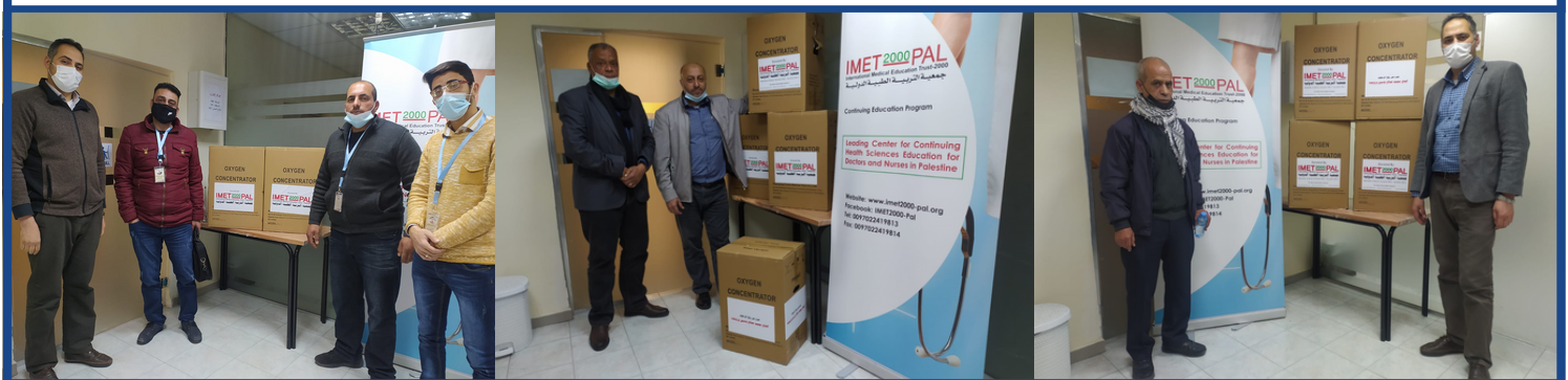
The Eastern region of Nablus