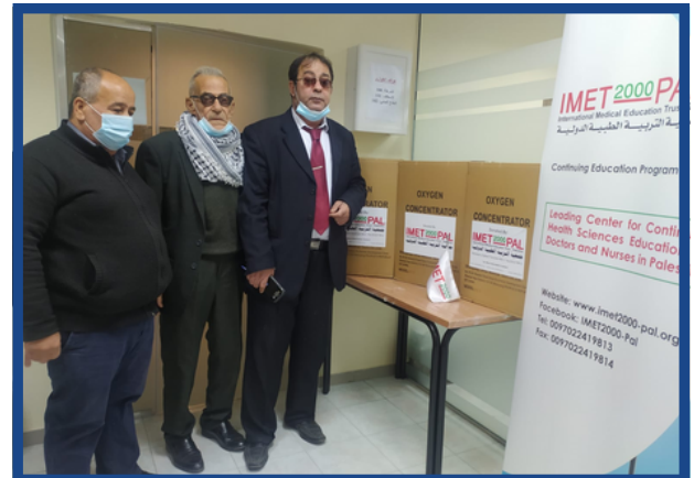
Al Fara'a refugee camp