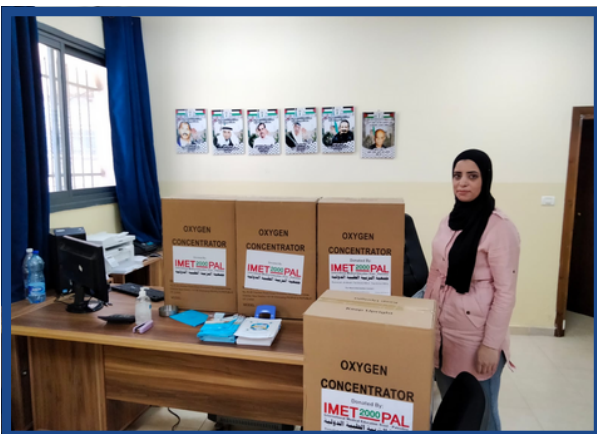
Am'ari refugee camp