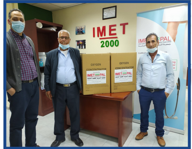
Municipality of Qatanna