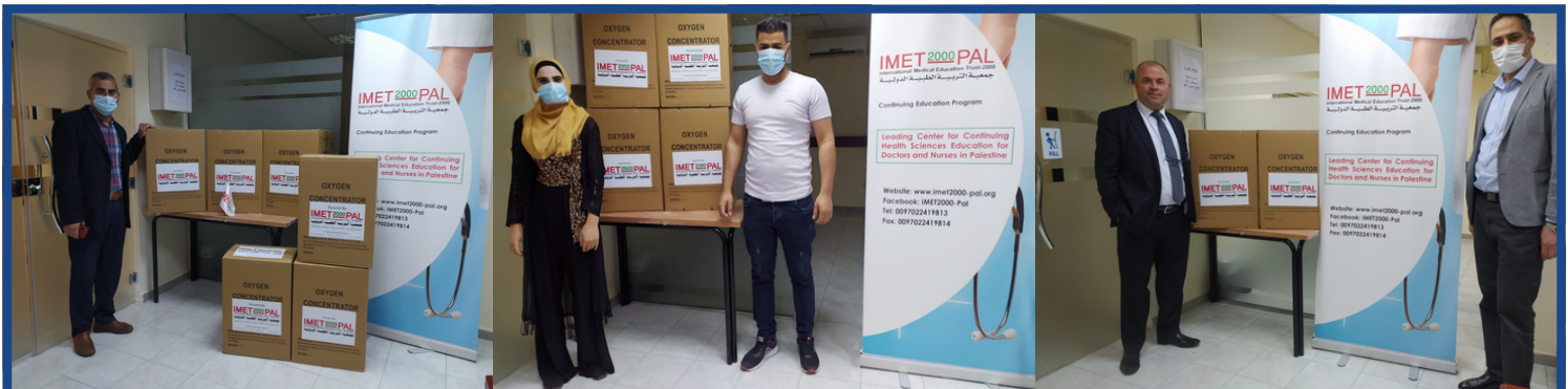
Kufrdan Municipality & Al Yamun Town

This month we have started distributing more than 50 oxygen generators to many villages and refugee camps across the West Bank. This was done to help the health sector in Palestine cope with the pandemic. As the number of cases rises, we hope to relieve hospitals by providing home-oxygen therapy for those who otherwise would have to be treated as in-patients. This primarily includes patients with mild to moderate COVID symptoms who do not necessarily require positive pressure oxygen therapy (CPAP) or ventilation in intensive care. This project also aims to discharge patients from hospitals as soon as it is safe to do so, in order to open up more spaces for people with serious symptoms.