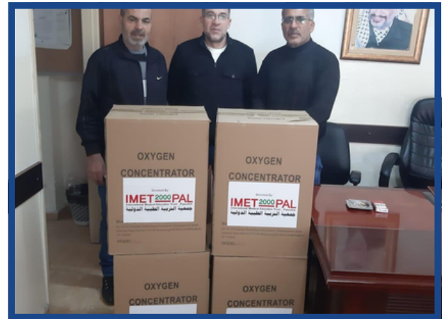
Qalandiya refugee camp