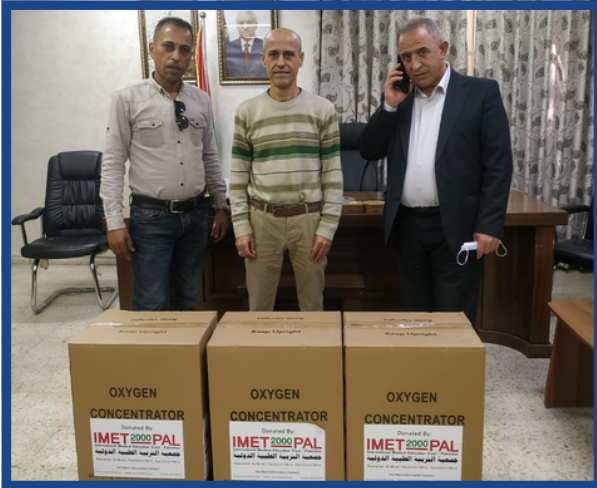
Balata refugee camp