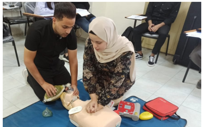
19th, Oct 2021- IMET Training Centre