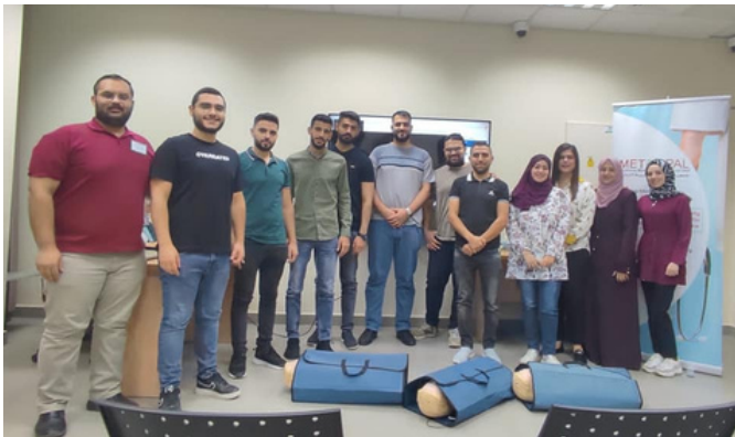
13th, Oct 2021- An-Najah Training Centre

These workshops are designed for governmental and private hospitals to increase the efficiency of the healthcare system at West Bank especially during this hard time and they were attended by 20 doctors and nurses from emergency and intensive care units. The Workshops held at An- Najah life support training centre in An-Najah National University and IMET training centre. the aim of these workshops is to learn about Cardiopulmonary resuscitation (CPR) for healthcare professionals, Automated External Defibrillation (AED) and First Aid. The workshops were led by (American Heart Association “AHA”) Instructors.