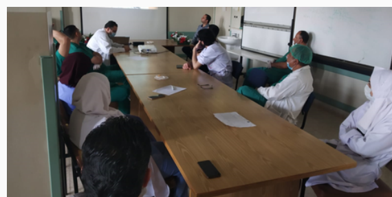
Jericho Governmental Hospital