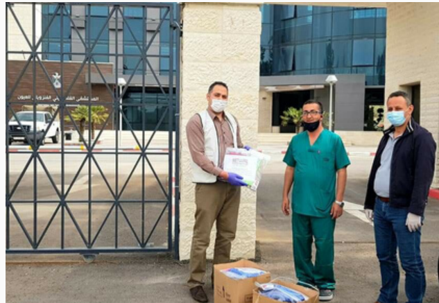
COVID-19 Treatment Center, Ramallah