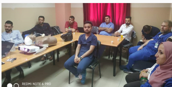
Tubas Governmental Hospital