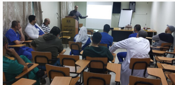
Tulkarem Governmental Hospital