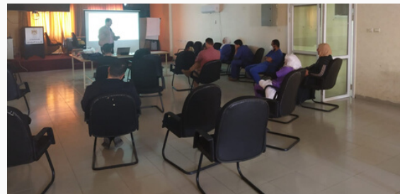
Rafidia Governmental Hospital