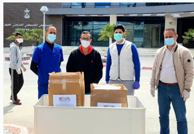
COVID-19 Treatment Center, Ramallah