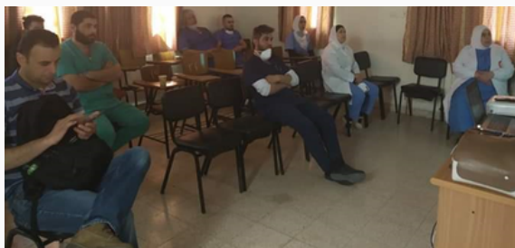
National Hospital, Nablus