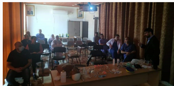
Qalqilyah Governmental Hospital