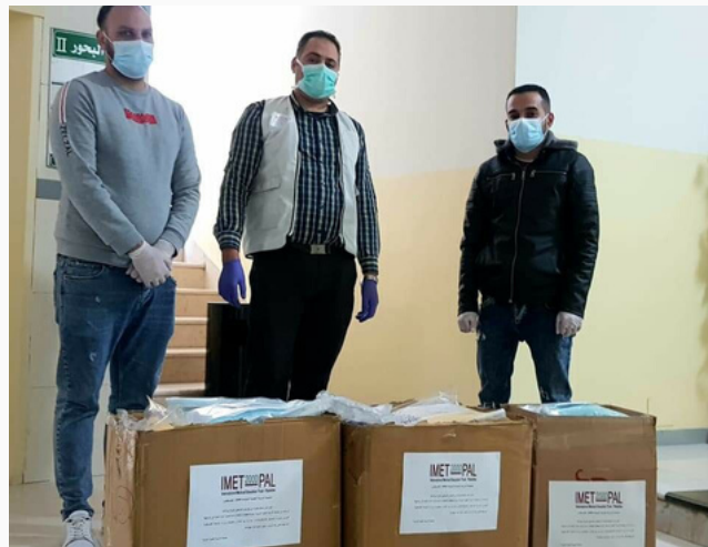
COVID-19 Treatment Center, Bethlehem