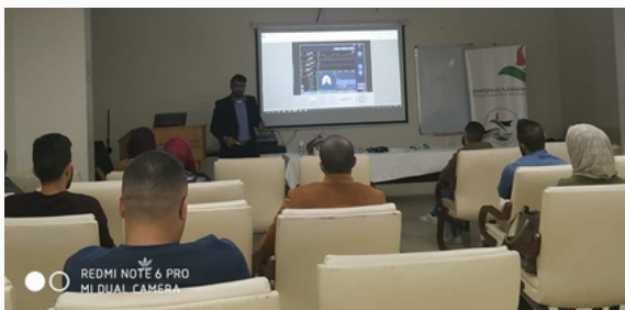
An-Najah National University Hospital, Nablus