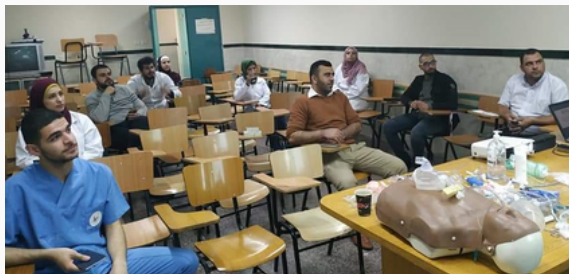
Jenin Governmental Hospital