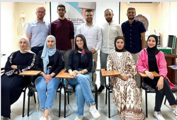
B1S 9th, September, 2024

They were led by certified instructors from the Modern College University and An-Najah National University Heart Centres - American Heart Association (AHA).