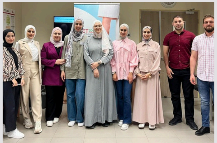
B1S 25th, September, 2024