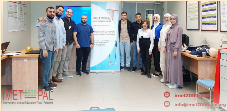
An-Najah National University Training Centre

IMET2000-Pal in cooperation with the An-Najah National University, the Modern University Collage and Arab American University Heart Centres organised three Critical Core Training: Basic Life Support (BLS) Training for Healthcare Professionals attended by 27 doctors and nurses from governmental and private hospitals in response to the current situation and the difficult conditions and incursions Jenin city is facing.