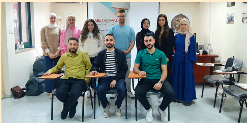
IMET2000 Training Centre

These trainings aimed to provide instructions and practical sessions about adult, child, and infant Cardiopulmonary Resuscitation (CPR) for healthcare professionals and Automated External Defibrillation (AED). They were led by certified instructors from the American Heart Association (AHA).