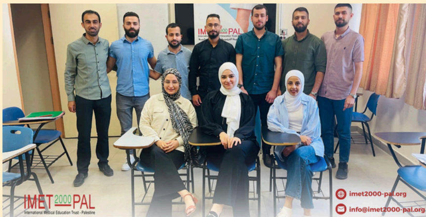
Arab American University Training Centre