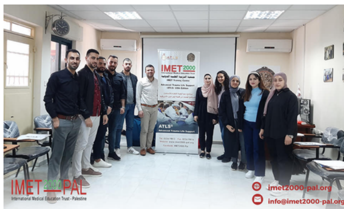
BLS 8th, May, 2023

The workshops took place at IMET2000-Pal Training Centre at Ramallah and aimed to provide instructions and practical sessions about Cardiopulmonary Resuscitation (CPR) for healthcare professionals, Automated External Defibrillation (AED) and First Aid. They were led by certified instructors from American Heart Association(AHA).