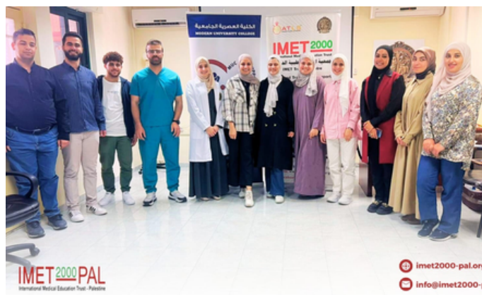
BLS 14th, May, 2023