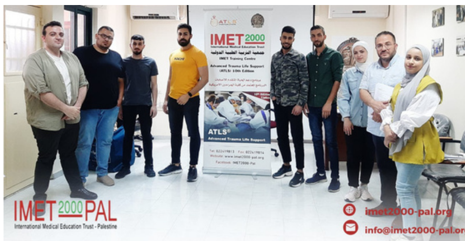
BLS 24th, May, 2023