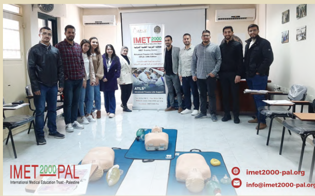
BLS 6th, March, 2023