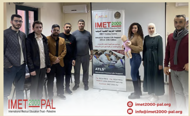
BLS 12th, March, 2023

The workshops took place at IMET2000-Pal Training Centre at Ramallah. These trainings aimed to provide instructions and practical sessions about Cardiopulmonary Resuscitation (CPR) for healthcare professionals, Automated External Defibrillation (AED) and First Aid. They were led by certified instructors from American Heart Association(AHA).