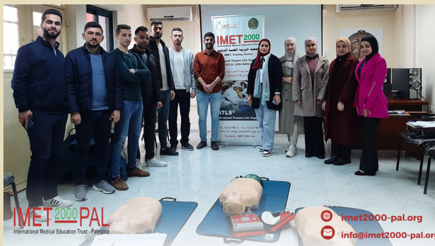
BLS 22nd, March, 2023

The workshops took place at IMET2000-Pal Training Centre at Ramallah. These trainings aimed to provide instructions and practical sessions about Cardiopulmonary Resuscitation (CPR) for healthcare professionals, Automated External Defibrillation (AED) and First Aid. They were led by certified instructors from American Heart Association(AHA).