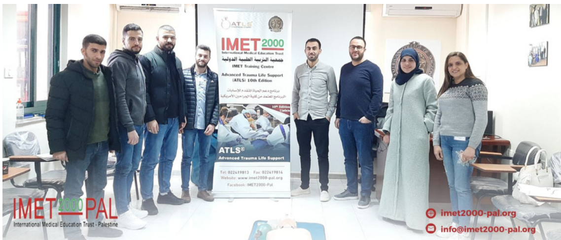
BLS 25th, February, 2023