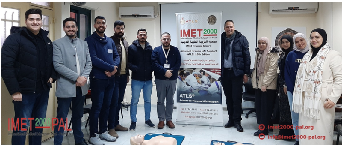
BLS 8th, February, 2023

The workshops took place at IMET2000-Pal Training Centre at Ramallah. These trainings aimed to provide instructions and practical sessions about Cardiopulmonary Resuscitation (CPR) for healthcare professionals, Automated External Defibrillation (AED) and First Aid. They were led by certified instructors from American Heart Association(AHA).