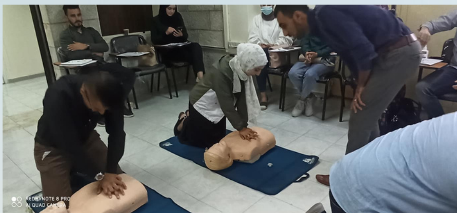
14th, Sep 2021- IMET Training Centre

These workshops were attended by 22 doctors from different hospitals in the West-Bank at Najah life support training centre in An-Najah National University and IMET training centre. the aim of these workshops is to learn about Cardiopulmonary resuscitation (CPR) for healthcare professionals, Automated External Defibrillation (AED) and First Aid. The workshops were led by (American Heart Association “AHA”) Instructors.