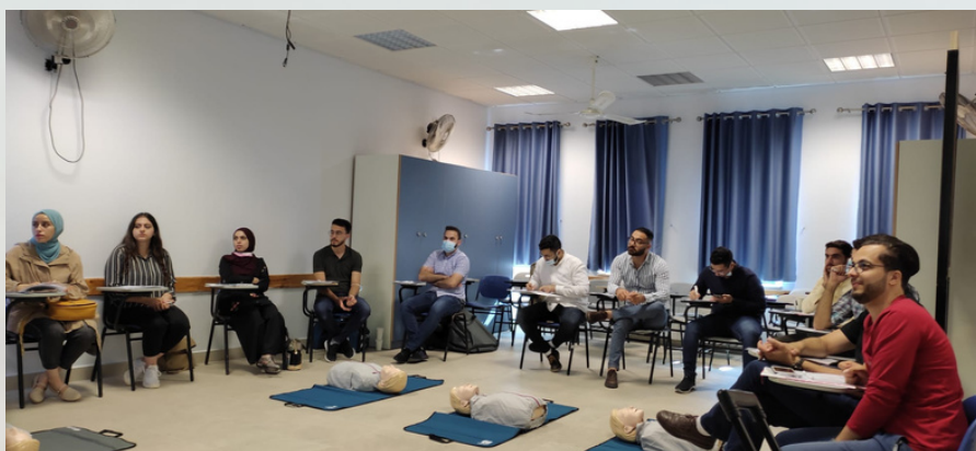
19th, Sep 2021 - Najah Life Support Training Centre